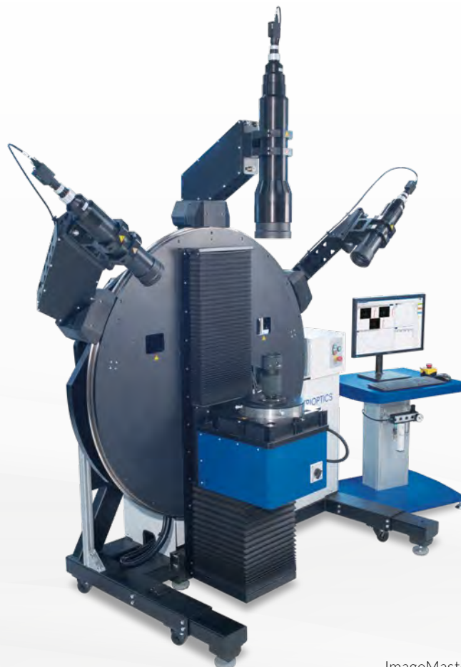
ImageMaster® Cine Flex

For high-precision measurements of the MTF and other optical parameters, the device can be equipped with a high-precision air bearing for the sample holder.