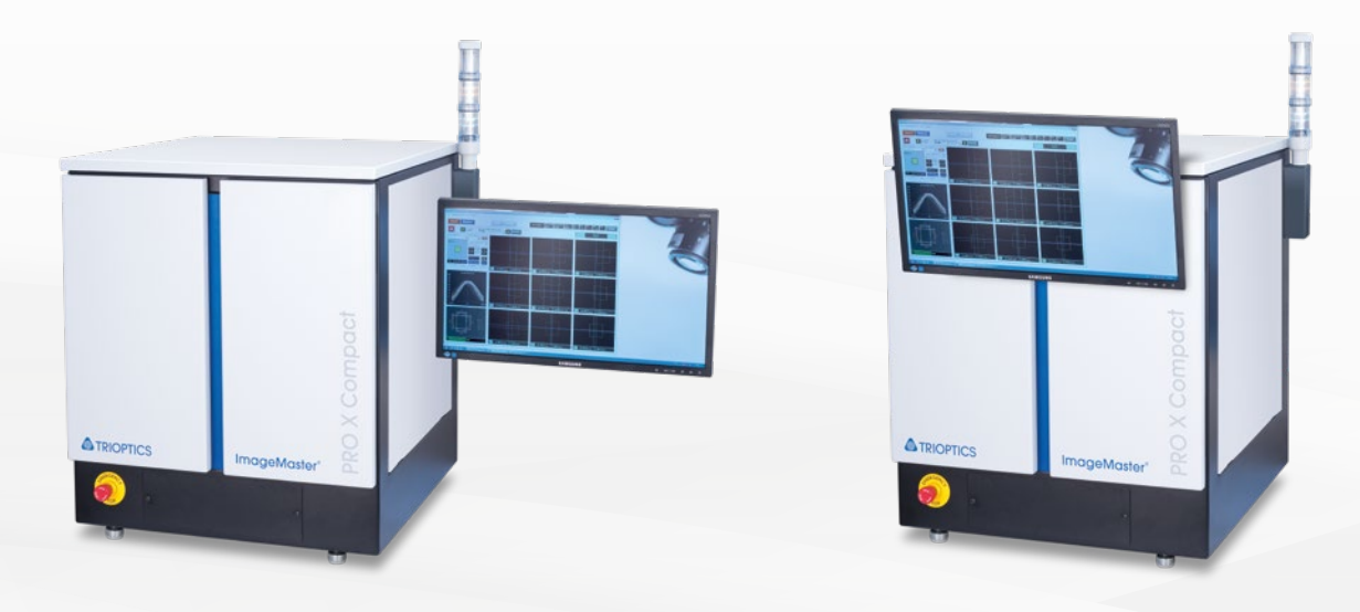
Table top device with side-mounted monitor

The monitor can be positioned in several configurations – mounted on the side or the front. This allows you to flexibly adapt the instruments' footprint based on your production environment.