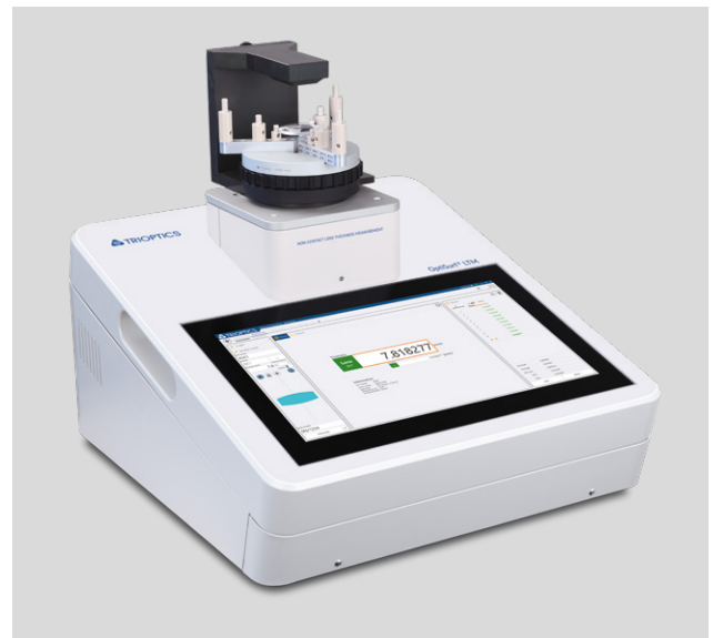
The OptiSurf® LTM non-contact center thickness measurement system from TRIOPTICS

Since Pfeiffer took over Färber Präzisionsoptik, the manufacturing processes in his own company have been assessed and tested for efficiency and effectiveness. The results