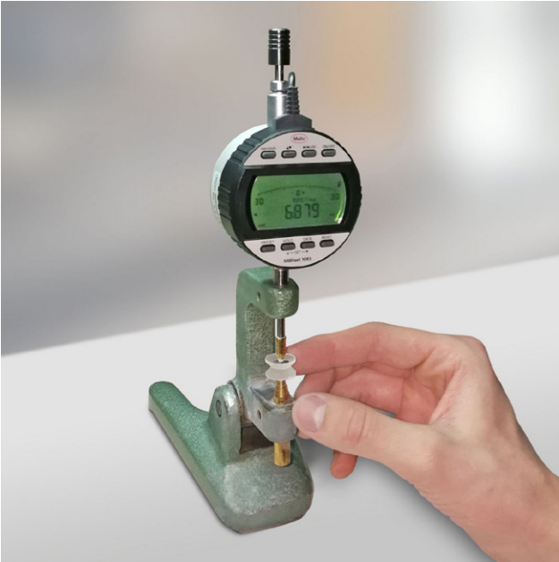
Mechanical dial gauge in use at Pfeiffer Präzisionsoptik

The challenge for the company owner was to implement more efficient and therefore cost-cutting measurement processes. Thanks to the optical measuring principle of the OptiSurf® LTM and because the lens is held by the device's clamping chuck, lenses can be measured immediately without the need for intermediate processing steps. Since only one surface has to be directly accessible, even a cemented auxiliary carrier does not interfere with the measuring process. "By using the OptiSurf® LTM, we have significantly optimized the test procedure for measuring the center thickness of lenses in our company," Pfeiffer tells Dr. Patrik Langehanenberg, Product Manager at TRIOPTICS, and continues: "The non-contact optical measurement makes it easy to determine the precise center thicknesses of individual lenses during the manufacturing process, so that the target value is achieved quickly and reliably. We save a considerable amount of time and expense because we can now take the lens directly out of the processing machine and measure it immediately. We no longer have to waste time on unproductive interim steps."