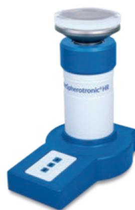
The SuperSpherotronic® HR for measuring the radius of curvature with an accuracy of up to \pm 0.01 %

The stable tabletop devices are easily operated using the buttons built into the base. They move the linear gauge upwards and downwards and start the measuring process. All other settings as well as the output of the measurement results are controlled by the SpheroPRO software.