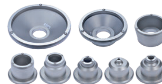
Precision rings with tungsten carbide balls for the SuperSpherotronic® HR and UltraSpherotronic®