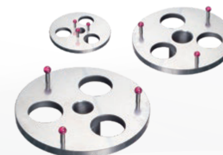
Precision rings with ruby balls for the SpheroCompact®

An additional foot switch is available to activate the measuring process.