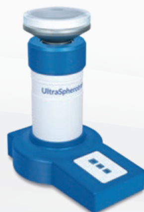
With a precision of \pm 0.005 %, the UltraSpherotronic® is used to calibrate reference samples.